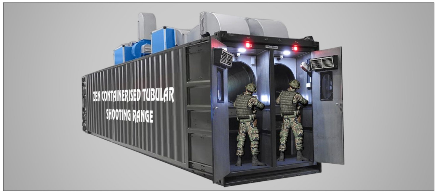
The little wonder: CTSR

All of 25 m, these AI-enabled products can provide multiple target effects starting from 25 m all the way to 1200 m for sniper fire. Their hybrid composition allows both the simulated as well as, live fire practice on smart, static and moving targets with accurate skill assessment.