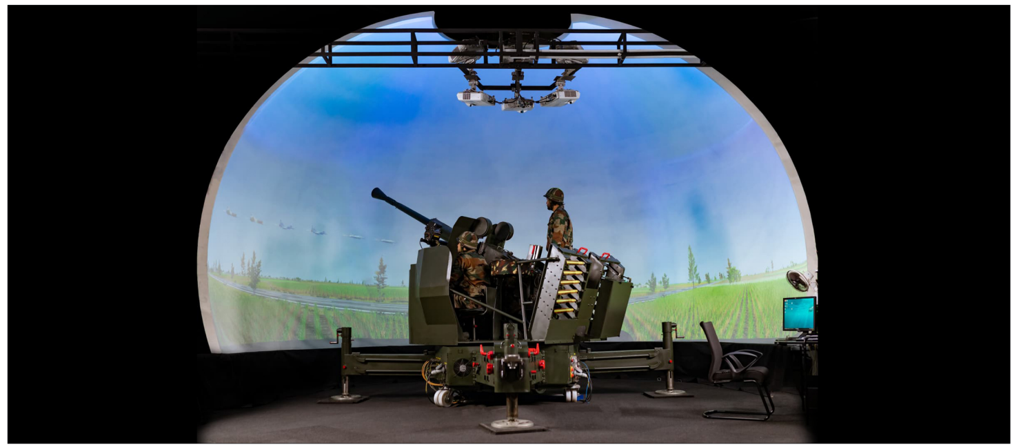
ZEN - IADCS

IADCS stands apart in its uniqueness. One big compliment to the ‘real look’ of its L 70 gun replica came when the officer who came for trials asked. “Where did you get the gun from?” We replied humbly, “Sir we made it from a scratch” .